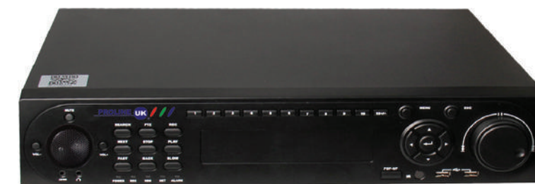
PR-IP 8825 NVR