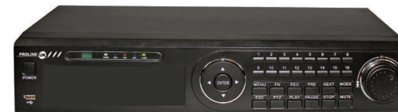
PR-IP 8832 NVR