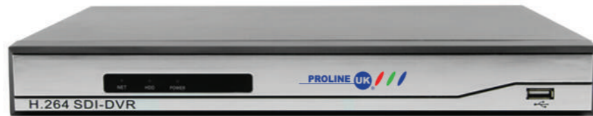
PR-HD 7100 HS Series