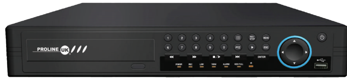
PR-AHD 9000 Series